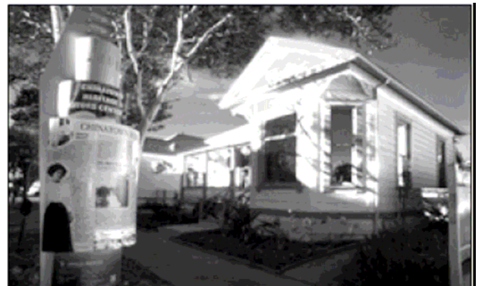
Chinese Historical society of Southern California Visitors' Center at 411 Bernard Street in Chinatown

The Portraits of Pride book may be purchased by contacting CHSSC (see address above) and is also available in selected public libraries in California and Washington for your reading pleasure.