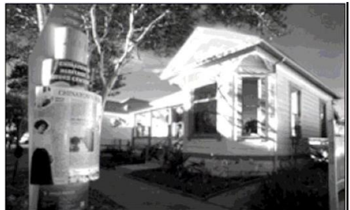
Chinese Historical society of Southern California Visitors' Center at 411 Bernard Street in Chinatown

Moved by their determination, many of their mentors, teachers, friends and neighbors gave a helping hand to these single-minded men and women. They worked hard and succeeded in their chosen professions, contributing to their local communities and to America. Their stories are a source of pride for all Americans.